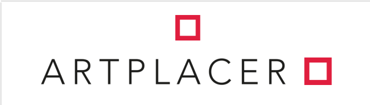
Don't use the Wordmark and the Symbol in the same layout in the same layout