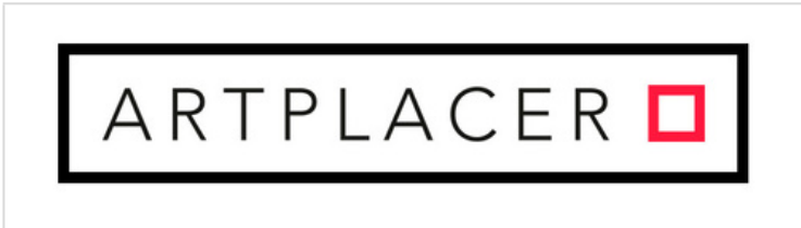
Don't place in a shape or container