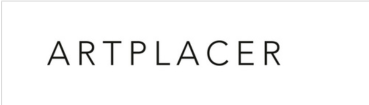
Don't use the wordmark alone