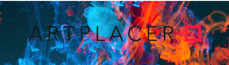
Don't place over busy backgrounds