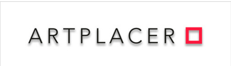
Don't add effects